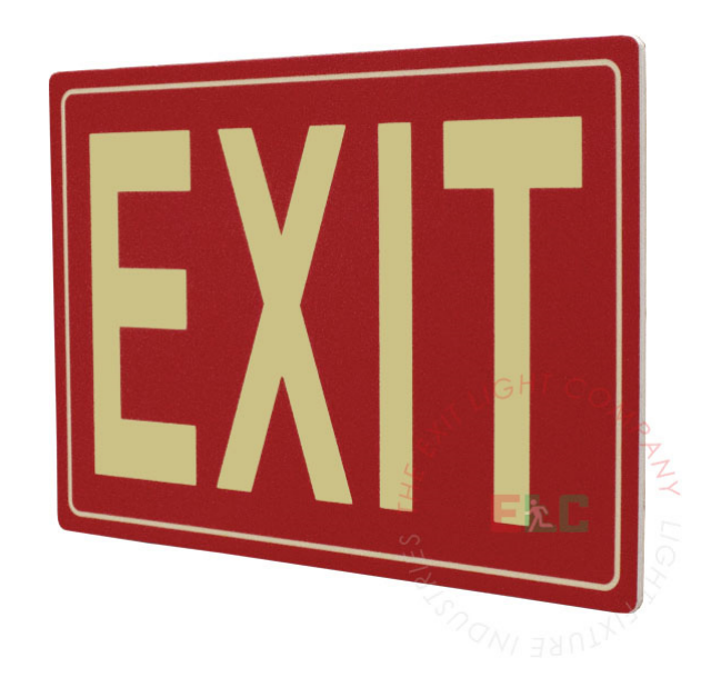
A simple, Glow in the Dark exit sign with self-adhesive backing.