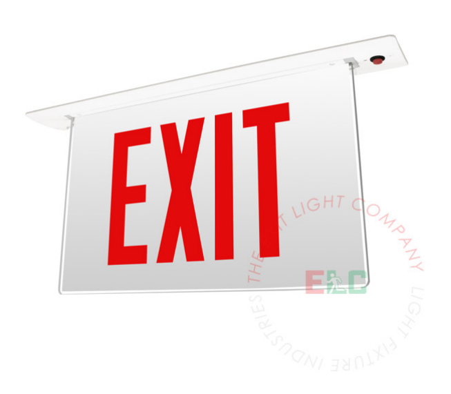
City of Chicago approved LED Edge Lit Exit sign with steel housing and acrylic face.